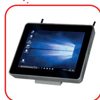
Computer / Software